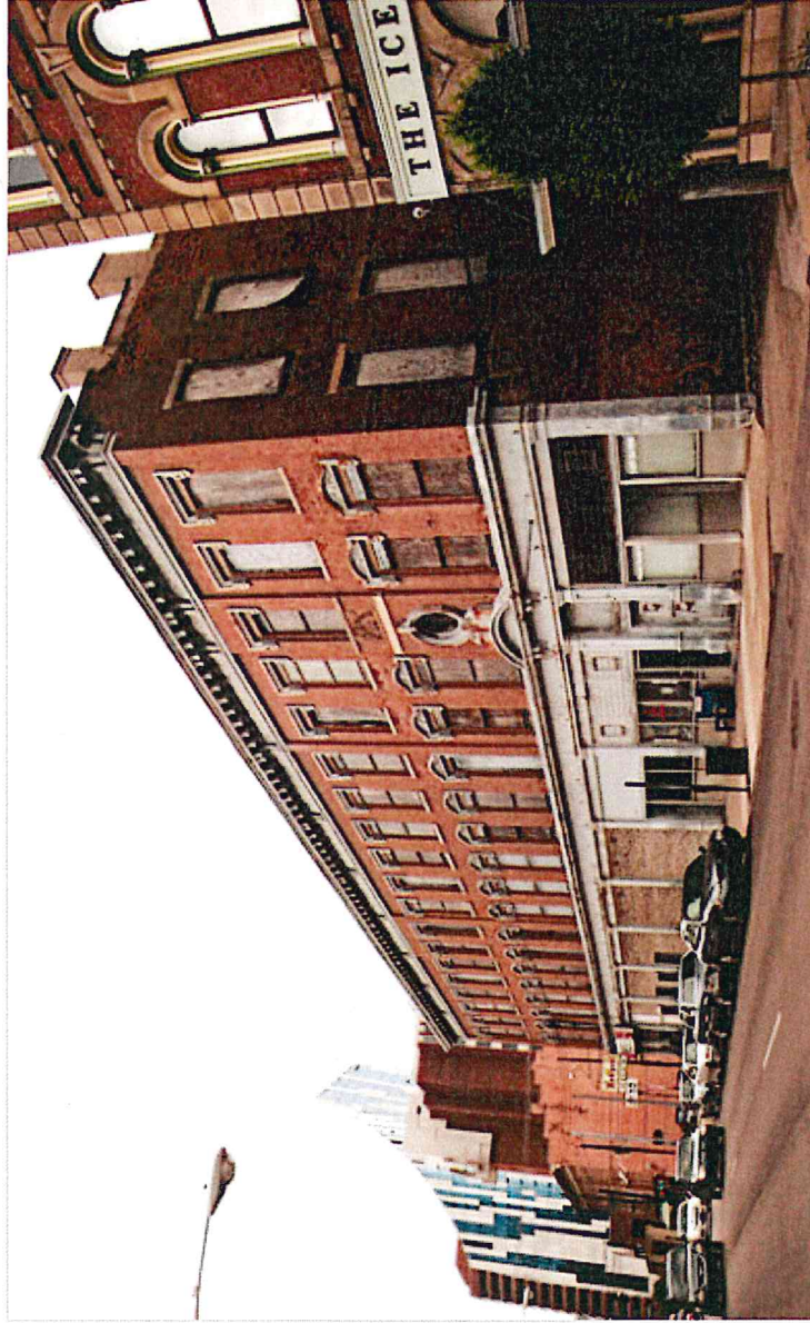
Boone Block (402-422 Scott Blvd.) will soon have new life as nine three-story single-family attached townhomes.